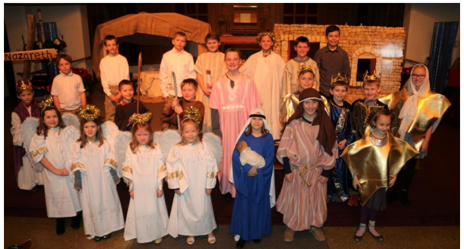
The cast of New Star , the OSL Children's Christmas program held 12/18