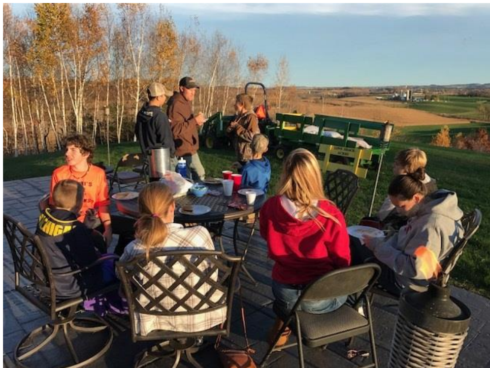
Mosaic Ministries Hayride on October 22

She will be starting here at Our Savior's in November. Please say hi and introduce yourself to her!