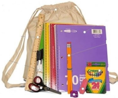
Lutheran World Relief School Kits

A book is a gift you can open again and again.