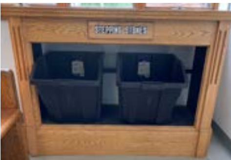
Located in the vestibule at the parking lot entrance to church.

Did you know that OSL has been collecting food as well as other items for Stepping Stones for the past 12 to 14 years? These items go directly to Stepping Stones on a weekly basis. This is different than items collected for our outside Little Free Pantry.